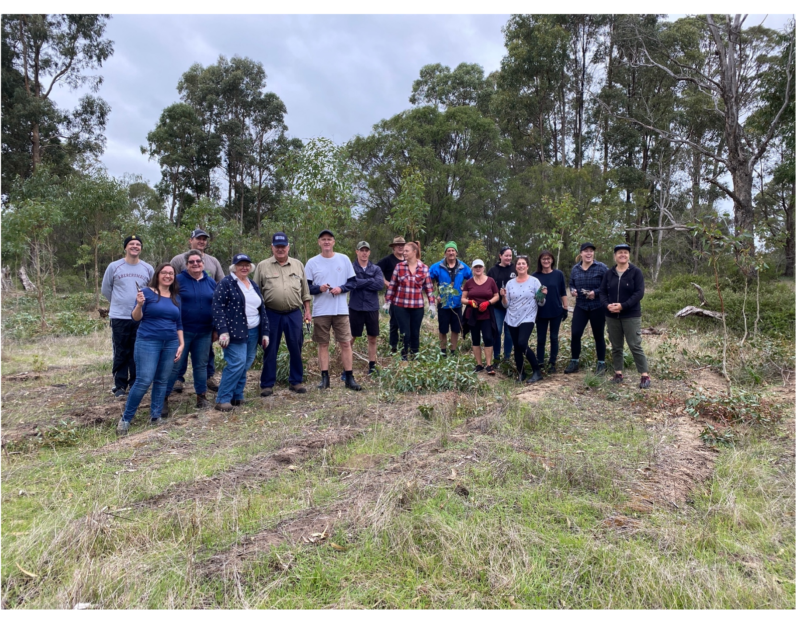
St Mary MacKillop College staff with some of our committee members

We also had help from a group of staff members from St Mary MacKillop College to prune lower branches of previously planted tuart trees in the Central block.